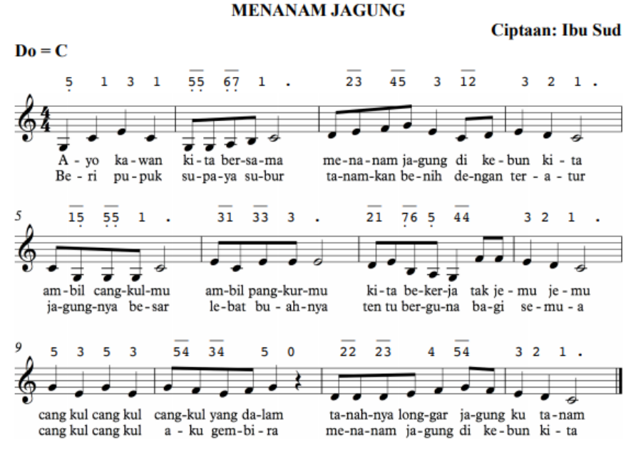
NB : Lagu "Menanam Jagung" terdapat juga di kelas 4 tema 2 Berhemat Energi

character values of the spirit of nationalism and patriotism.