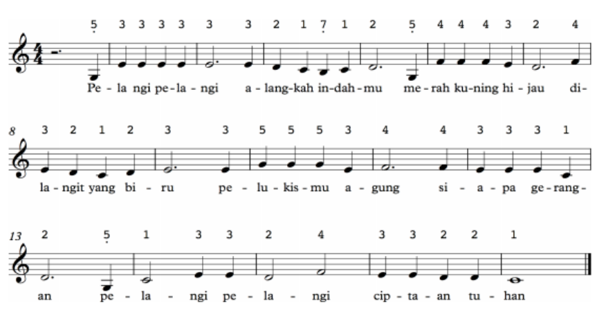
NB : Lagu "Pelangi" terdapat juga di kelas 2 tema 3 tugasku sehari-hari